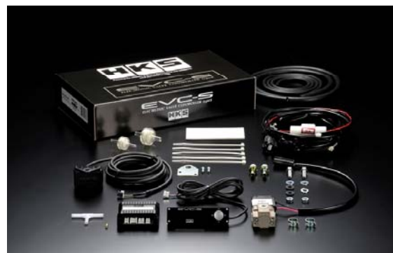
[Configuration of the units]